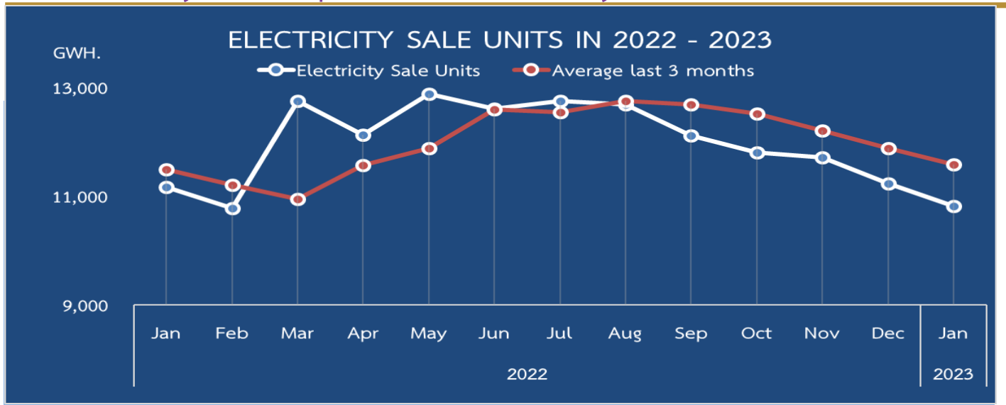
The Electricity Sales Report of PEA in January 2023

In January 2023, PEA had a total of 10,808.94 million units of electricity sales, which decreased at 3.18% YoY following the downtrend of world economic and restrictive monetary policy which affected Thai export especially to United States, Hong Kong and Australia. Moreover, there were trade barrier and an increase in minimum wage in business and industrial sectors. Construction segment didn't recover resulting from foreign investors' demand. Apart from cold weather in January, this caused a drop in electrical consumption.